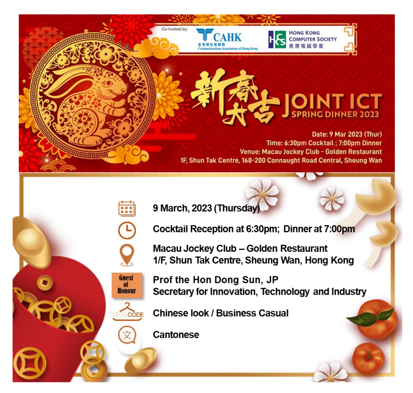
The Joint ICT Spring Dinner 2023 is sold out. See you there.