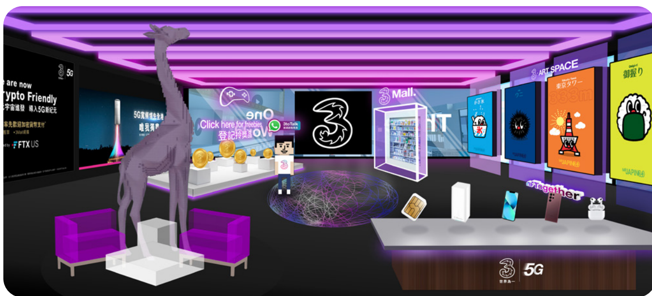
3 Hong Kong has set up a virtual 3Shop in Voxels metaverse platform. 3 香港在 Voxels 元宇宙平台建立虛擬門市。

元宇宙開發了嶄新的經濟模式,衍生龐大商機。彭博研究報告預期,元宇宙的市場規模在 2024 年達到 $8,000 億美元,可見元宇宙強大的發展潛力。早前,Meta、Microsoft、Sony、Adobe 和 Qualcomm 等多家科技巨頭,合組「元宇宙標準論壇」(Metaverse Standards Forum),共同開發元宇宙標準。多個著名運動品牌亦搶先投入元宇宙世界,製作虛擬角色,並推出限量 NFT;不少名人和藝術家更發行自家 NFT 項目,備受市場熱捧,可見元宇宙熱潮已席捲全球。